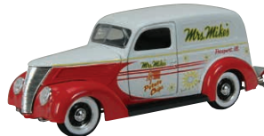
1937 Ford Panel opening doors, rear doors & hood