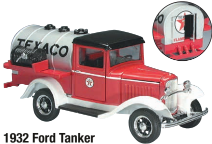
1932 Ford Tanker opening doors, rear doors & butterfly hood