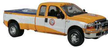
Ford F-350 Dually