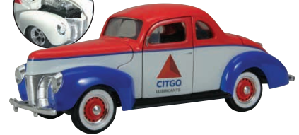
1940 Ford Coupe opening doors, trunk & hood