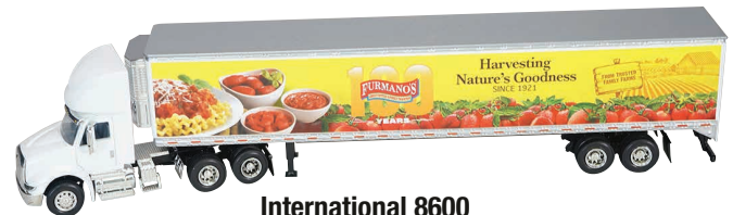
International 8600 shown with refrigeration unit option