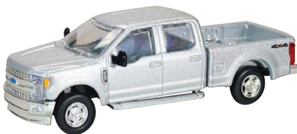
2017 Ford F350 Ingot Silver