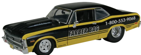
1970 Chevy Nova Pro Street Version opening doors, trunk & hood; detailed high-performance engine

Blank stock inventory available on select models with lower minimums and shorter lead-time.