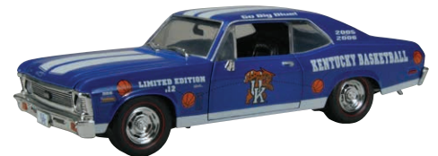
1970 Chevy Nova SS opening doors, trunk & hood; detailed high-performance engine