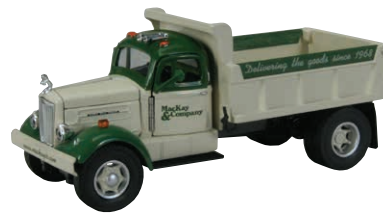
White Dump Body opening doors, box tilts up & butterfly hood