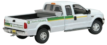
Ford F-250 and F-350 Full Size Toolbox