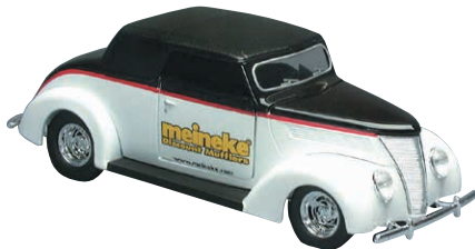
1937 Ford Cabriolet opening doors, trunk & hood