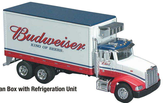
Van Box with Refrigeration Unit