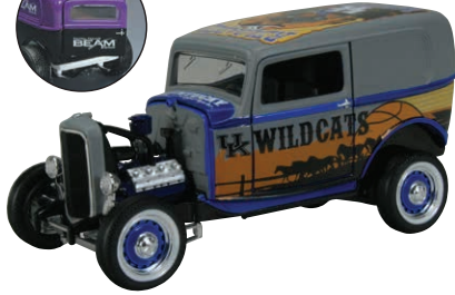
1932 Ford Sedan Street Rod opening doors, rear door & exposed engine