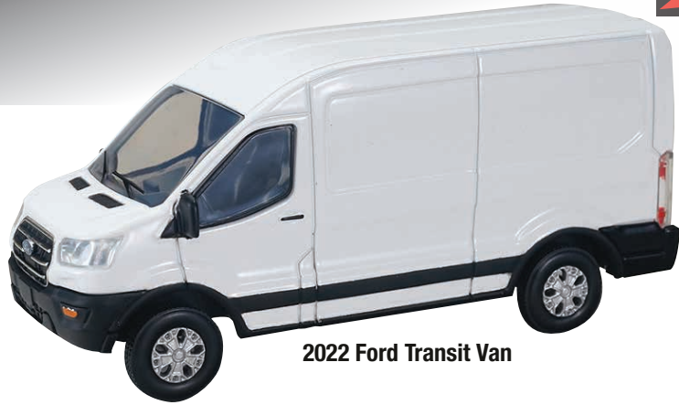
2022 Ford Transit Van