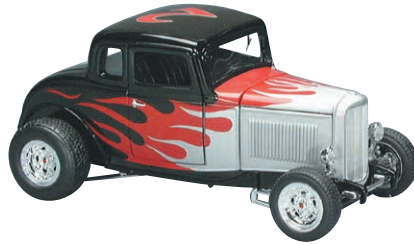
1932 Ford Coupe Street Rod opening doors, trunk & butterfly hood