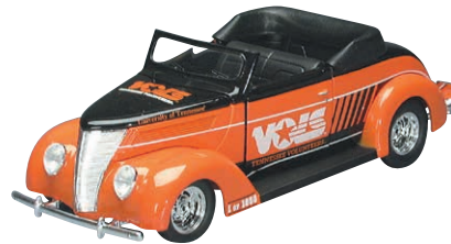
1937 Ford Convertible opening doors, trunk & hood