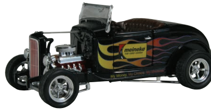
1932 Ford Roadster Street Rod opening doors, trunk & exposed engine