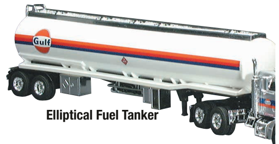
Elliptical Fuel Tanker