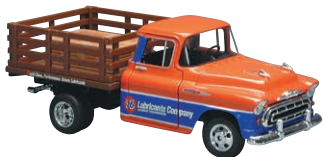
1957 Chevy Stakebed opening doors & hood