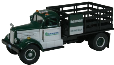
White Stake Body with Signboard opening doors & butterfly hood