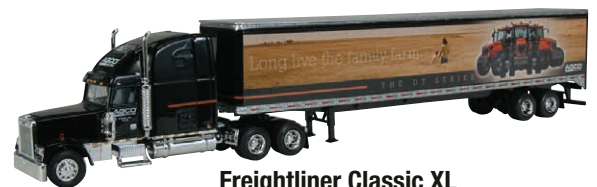
Freightliner Classic XL