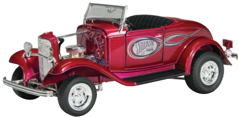
1932 Ford Roadster Street Rod fenders, opening doors, trunk & exposed engine