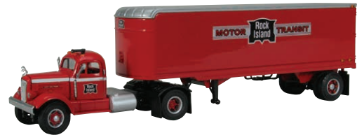
White Tractor-Trailer opening doors & butterfly hood