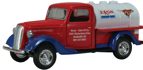
1937 Ford Tanker opening doors, rear doors & butterfly hood