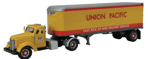
KB-8 Tractor-Trailer opening doors & butterfly hood