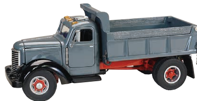
KB-8 Dump Body opening doors, box tilts up & butterfly hood