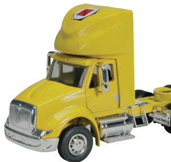
International 8600 with Airfoil