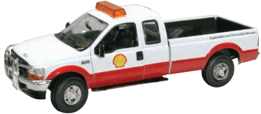
Ford F-250 and F-350 Light Bar and Grille Guard