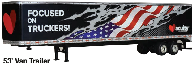
53' Van Trailer