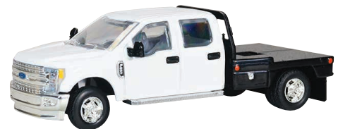
Ford F250 White flatbed