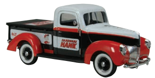
1940 Ford Pickup opening doors & hood