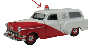
1954 Chevy Sedan opening doors, rear door & hood