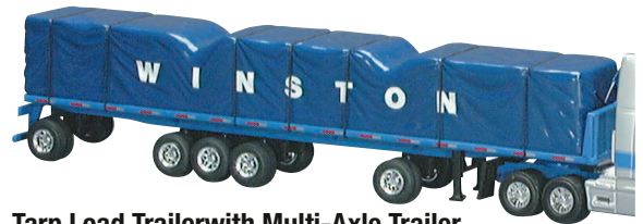
Tarp Load Trailer with Multi-Axle Trailer