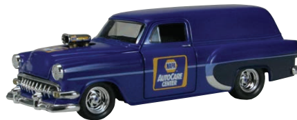
1954 Chevy Sedan Street Rod opening doors, trunk & hood