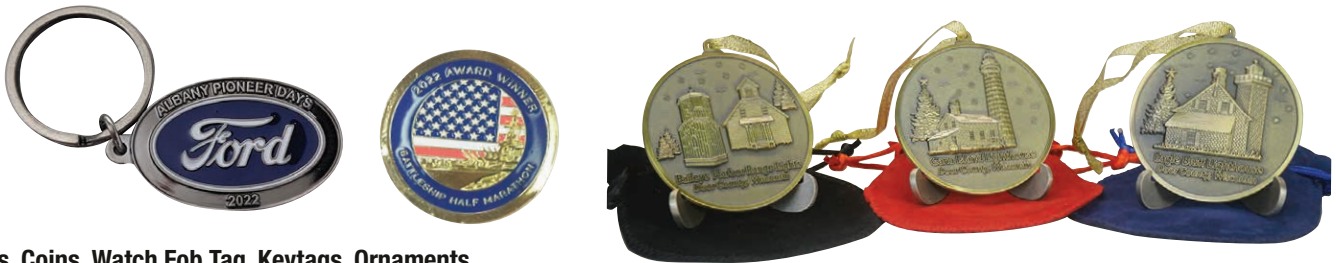
Medallions, Coins, Watch Fob Tag, Keytags, Ornaments enamel insert or color fill • Coins (3/4" to 1 1/2")