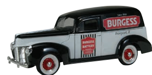
1940 Ford Panel opening doors, rear door & hood