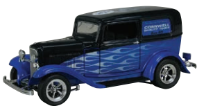
1932 Ford Sedan Delivery opening doors, rear doors & butterfly hood