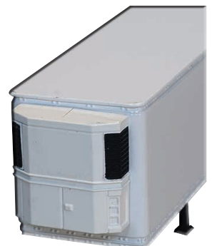
white & black