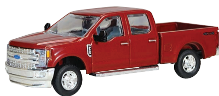
2017 Ford F350 Ruby Red