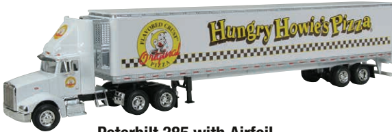
Peterbilt 385 with Airfoil shown with refrigeration unit option