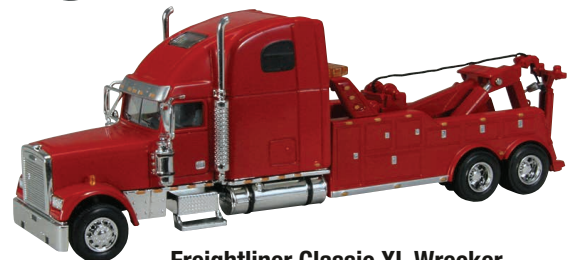
Freightliner Classic XL Wrecker