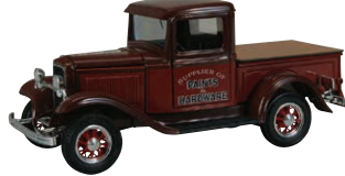
1932 Ford Pickup opening doors, butterfly hood & sliding tonneau cover