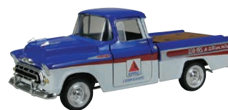
1957 Chevy Cameo Pickup opening doors, hood & crates