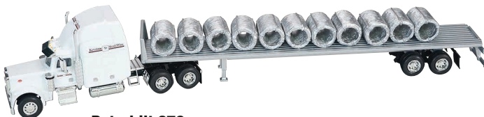
Peterbilt 379 shown with flatbed trailer & custom load option