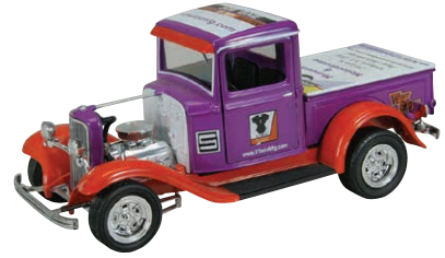
1932 Ford Street Rod Pickup opening doors, sliding tonneau cover & exposed engine