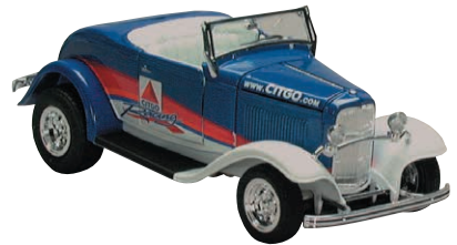
1932 Ford Roadster opening doors, trunk & butterfly hood