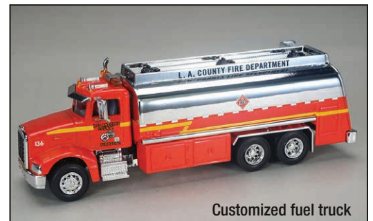
Customized fuel truck