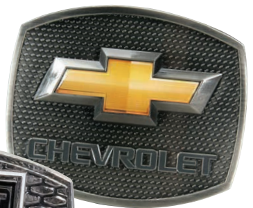
enamel insert or color fill