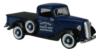
1937 Ford Pickup opening doors & sliding tonneau cover