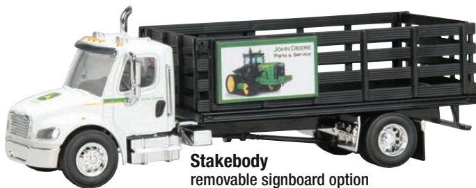
Stakebody removable signboard option