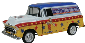
1957 Chevy Panel opening doors, rear doors & hood