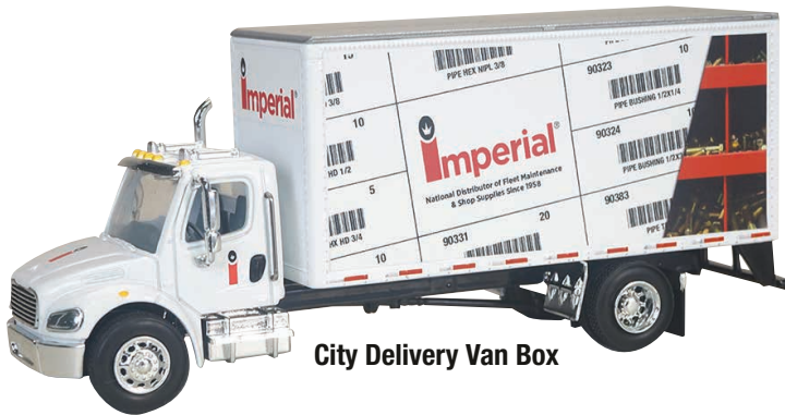
City Delivery Van Box

VAN BOX, STAKEBODY, WRECKER, FUEL TRUCK & MORE PETERBILT 385 AND FREIGHTLINER M2 CAB OPTIONS