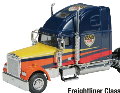
Freightliner Classic XL