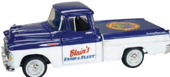
1957 Chevy Cameo Pickup opening doors, hood & sliding tonneau cover