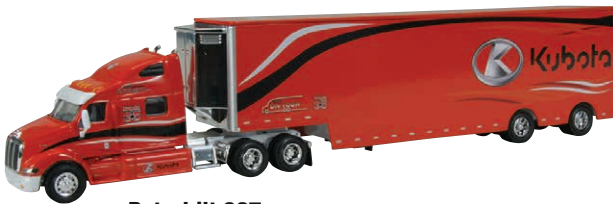
Peterbilt 387 shown with dropped trailer option