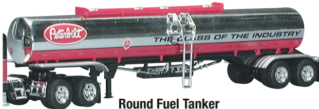
Round Fuel Tanker