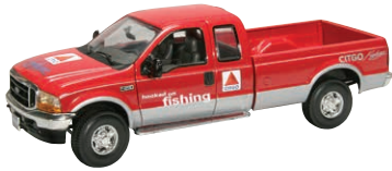
Ford F-250 and F-350 Standard Body