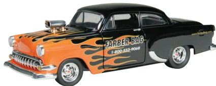
1954 Chevy Coupe Street Machine opening doors, trunk & hood