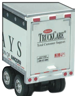
opening single door