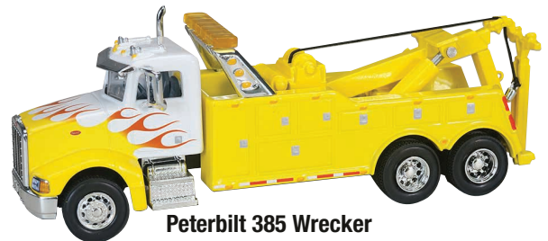
Peterbilt 385 Wrecker