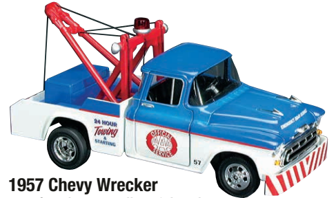
1957 Chevy Wrecker opening doors, toolbox & hood