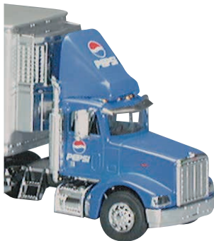
Peterbilt 385 with Airfoil