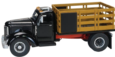
KB-8 Stake Body with Signboard opening doors & butterfly hood