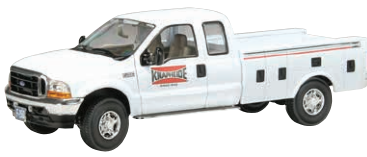
Ford F-250 and F-350 Service Body