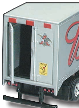
opening double doors