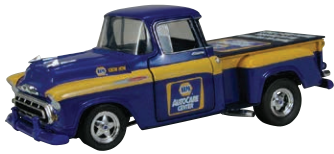
1957 Chevy Stepside Pickup opening doors, hood & sliding tonneau cover