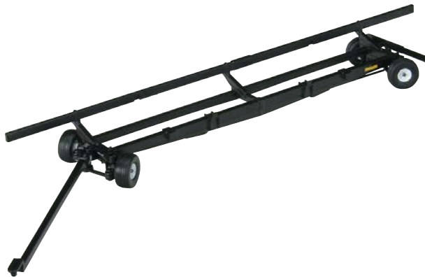
UBC 006 Unverferth header transport - black