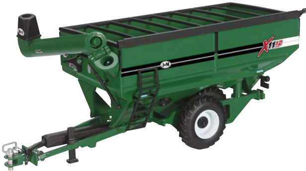
CUST 1864 J&M grain cart dual wheel - green