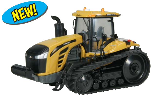
SCT 771 Challenger MT875 with tracks