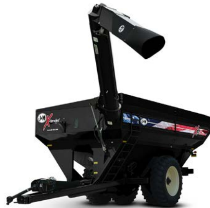
JMM 006 J&M grain cart dual wheels - black American decal