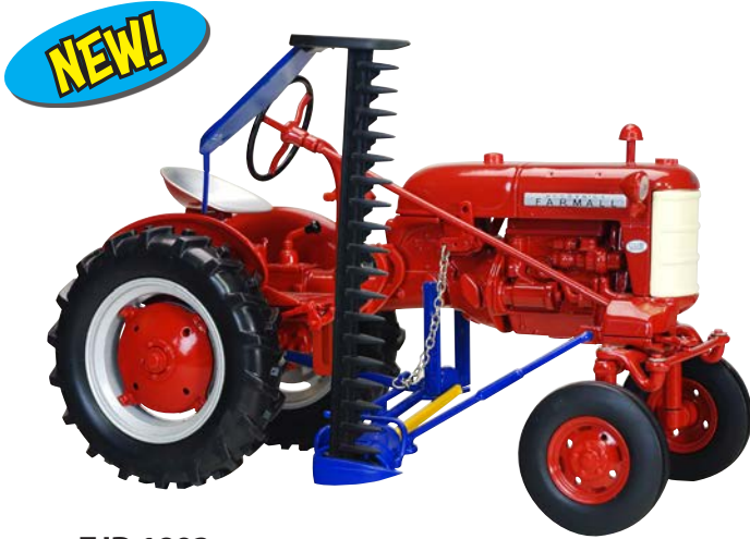
ZJD 1893 Farmall Cub with sickle mower