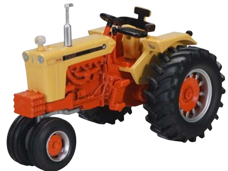
ZJD 1884 Case 930 narrow front