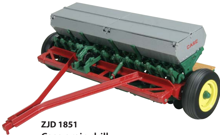
ZJD 1851 Case grain drill