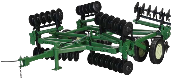
SCT 690 Oliver 263 disc with 14' wings