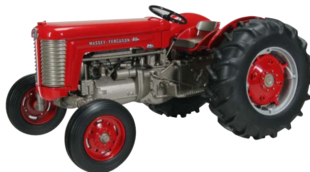
SCT 762 Massey Ferguson 65 wide front gas