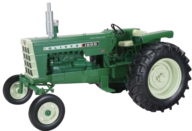
SCT 739 Oliver 1650 wide front diesel