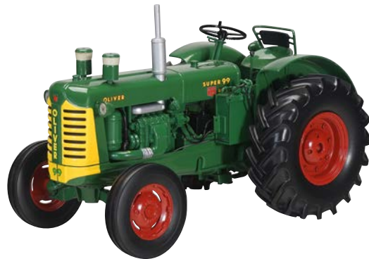
SCT 735 Oliver Super 99 diesel