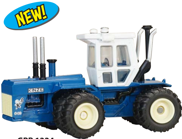
GPR 1334 Kinze Big Blue tractor