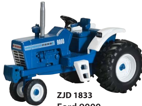
ZJD 1833 Ford 9000