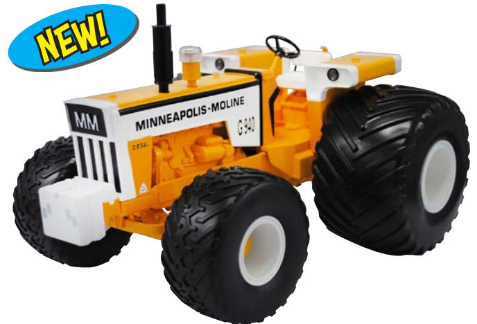
SCT 774 Minneapolis Moline G940 with terra tires Available in June