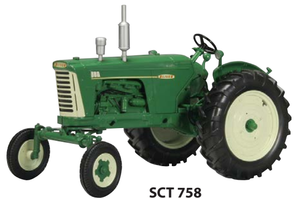
SCT 758 Oliver 880 wide front