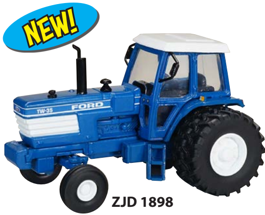
ZJD 1898 Ford T-35 2WD with duals