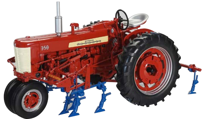
ZJD 1852 Farmall 350 with 2-row cultivator