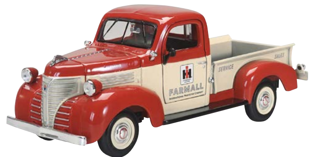
ZJD 1858 Farmall 1941 Plymouth pickup