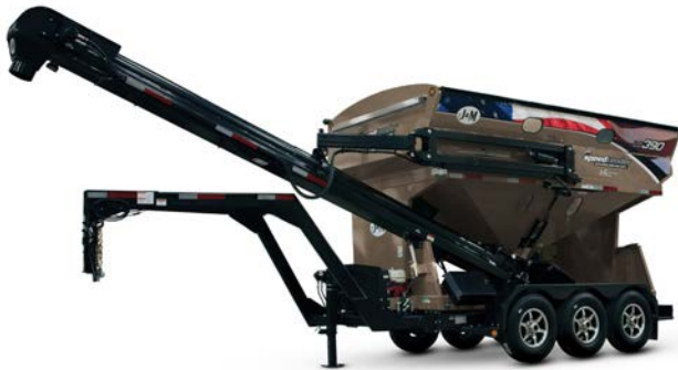
JMM 002 J&M seed tender 390 - tan American decal