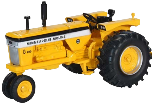
SCT 712 Minneapolis Moline G900 narrow front