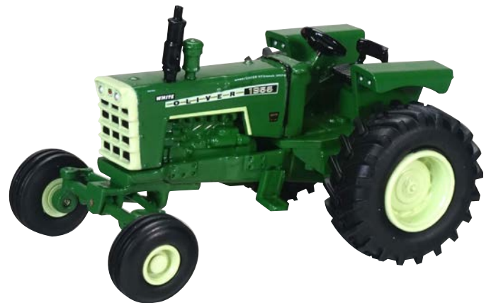
SCT 680 Oliver 1955 - wide front