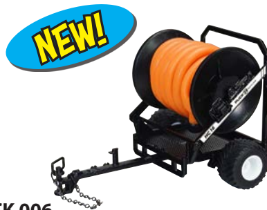
PCK 006 Puck HC-16 hose cart with hose