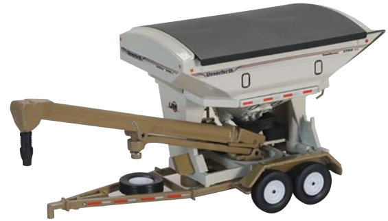
UBC 002 Unverferth 2755XL seed tender