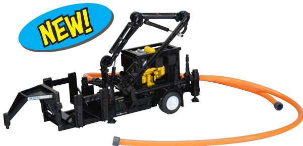
PCK 005 Puck FF5770 Force Feed with boom