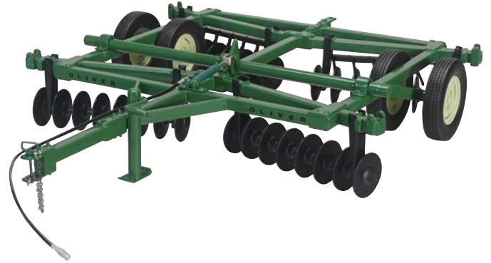
SCT 768 Oliver 242 disc 10'