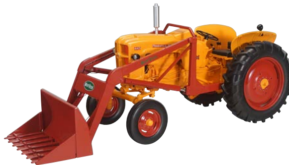
SCT 745 Minneapolis Moline 445 wide front with loader