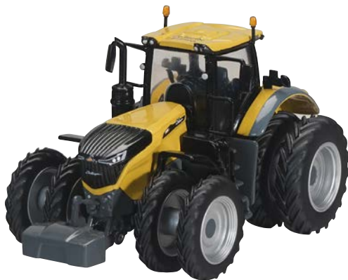
SCT 718 Challenger 1050