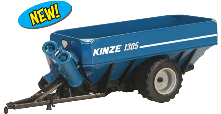
GPR 1337 Kinze 1305 Sof-Tred grain cart