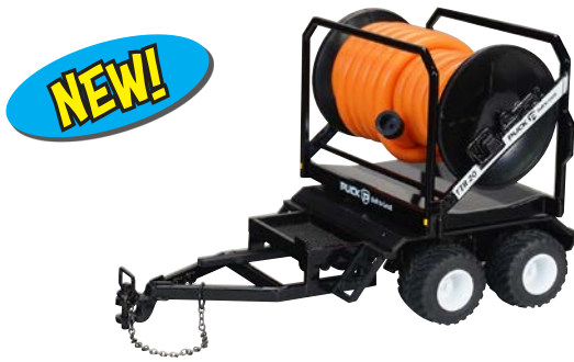
PCK 001 Puck TTR-20 turn table hose reel with hose