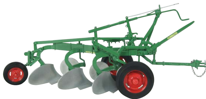
SCT 422 Oliver 3 bottom plow on rubber