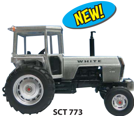
SCT 773 White 2-85 with cab