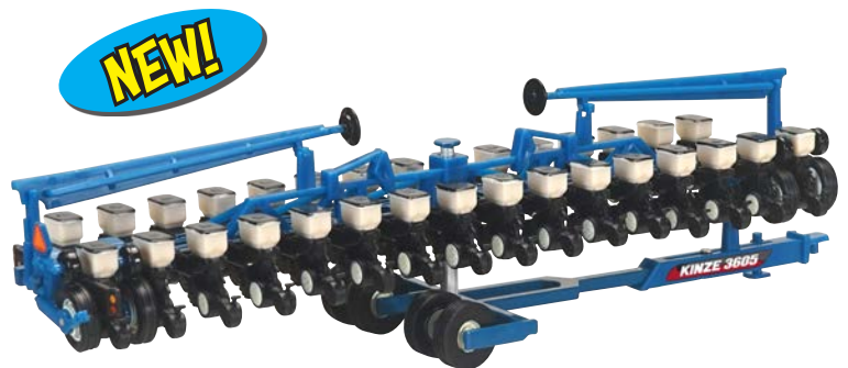
GPR 1335 Kinze 3605 16 row planter