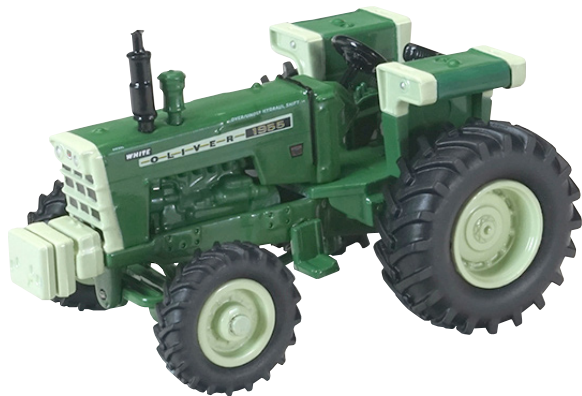
SCT 677 Oliver 1955 with power assist