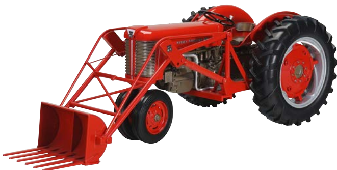
SCT 731 Massey Ferguson 65 diesel narrow front with loader