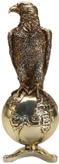
ZJD 1883 Case Eagle on globe, bronze