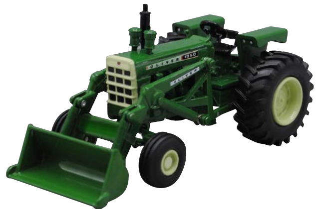
SCT 733 Oliver 1950 wide front with loader