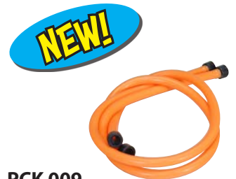
PCK 009 Puck Bulldog hose kit