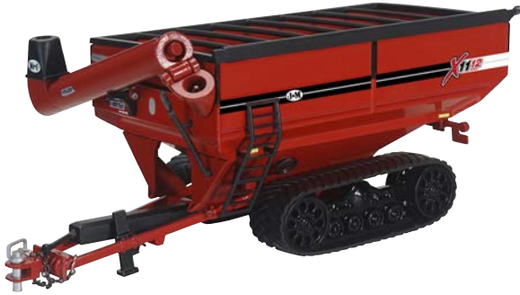
CUST 1659 J&M 1112 grain cart with tracks - red