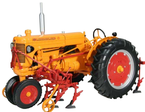
SCT 391 Minneapolis Moline U Gas narrow front with 2 row cultivator