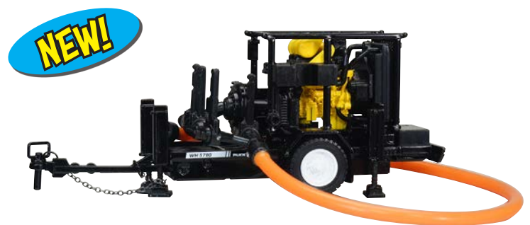
PCK 004 Puck WH5780 pump unit