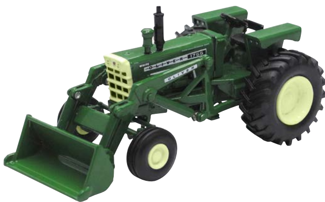
SCT 734 White Oliver 1755 wide front with Loader