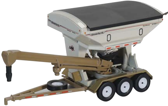
UBC 001 Unverferth 3755XL seed tender