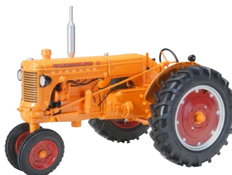
SCT 568 Minneapolis Moline U