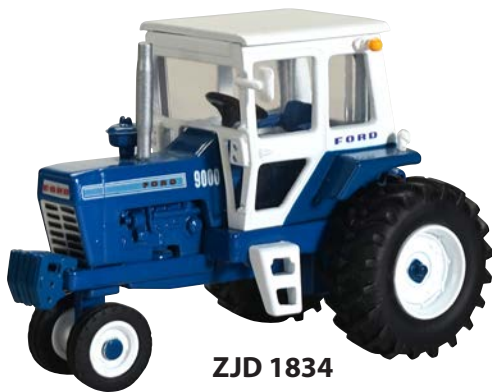
ZJD 1834 Ford 9000, with cab