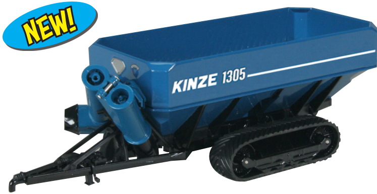
GPR 1336 Kinze 1305 grain cart with tracks