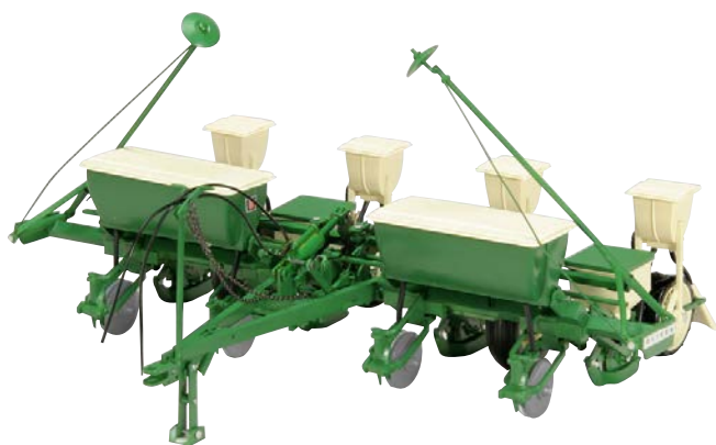
SCT 703 Oliver 540 planter