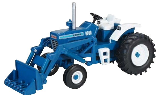
ZJD 1836 Ford 9000, loader