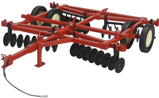
CUST 1961 Red 10' disc