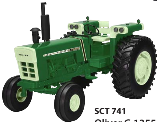
SCT 741 Oliver G 1355