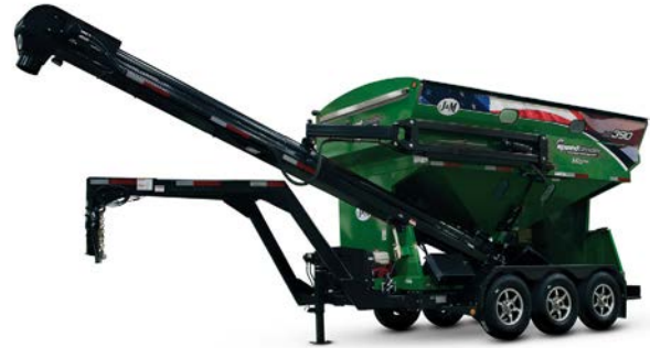
JMM 001 J&M seed tender 390 - green American decal