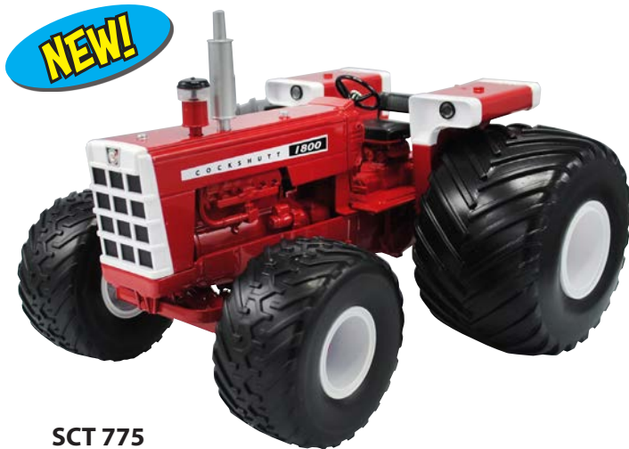
SCT 775 Cockshutt 1800 with terra tires Available in June