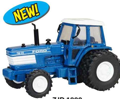
ZJD 1899 Ford T-35 4WD with duals