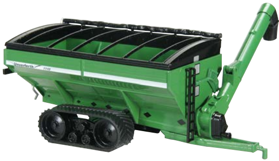
UBC 005 Unverferth grain cart with tracks- green