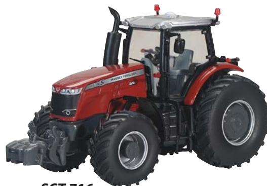
SCT 716 Massey Ferguson 8730S