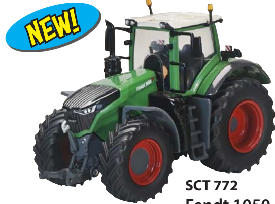
SCT 772 Fendt 1050