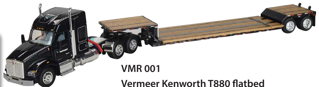
VMR 001 Vermeer Kenworth T880 flatbed