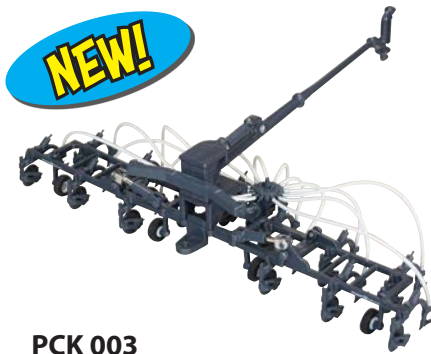
PCK 003 Dietrich toolbar with mounted swingarm