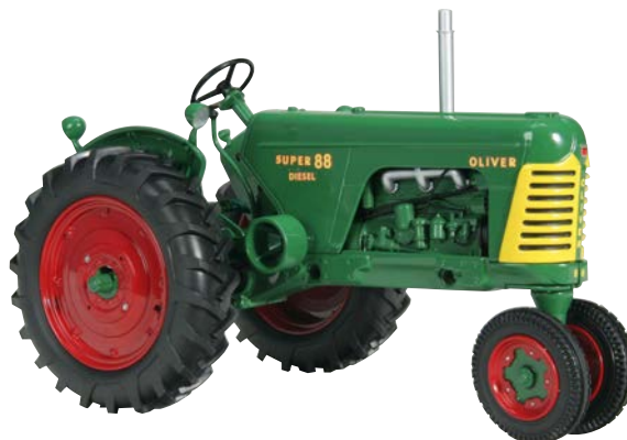
SCT 767 Oliver Super 88