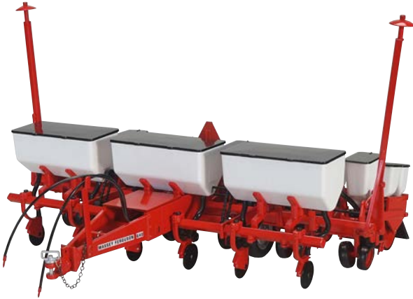
SCT 761 Massey 640 planter