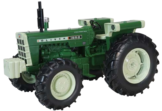
SCT 684 Oliver 1650 FWA