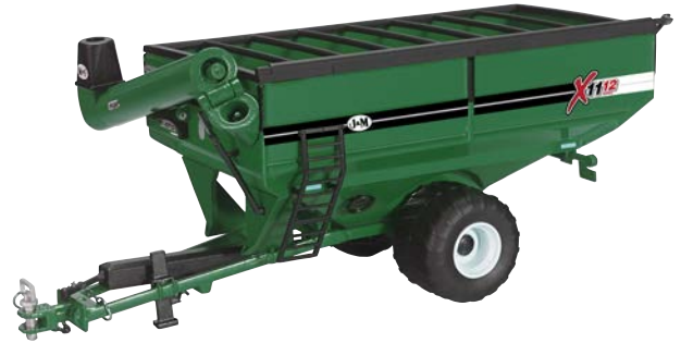
CUST 1863 J&M grain cart single wheel - green