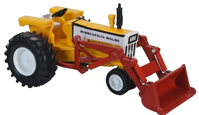
SCT 732 Minneapolis Moline G850 narrow front with Loader