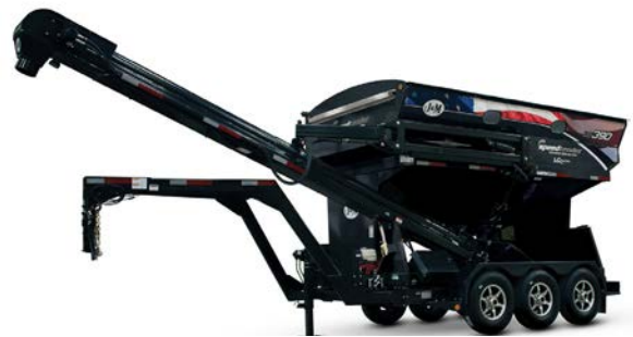
JMM 005 J&M seed tender - black American decal