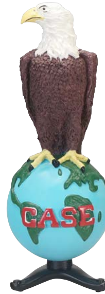
ZJD 1882 Case Eagle on globe