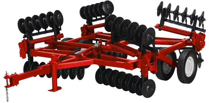
CUST 1860 Red disc 14' with wings