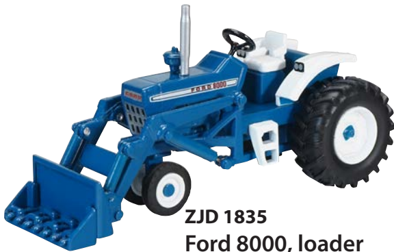
ZJD 1835 Ford 8000, loader