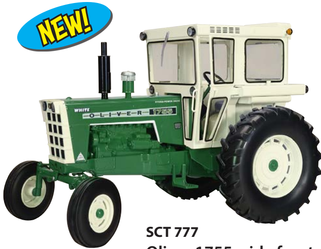
SCT 777 Oliver 1755 wide front diesel with cab